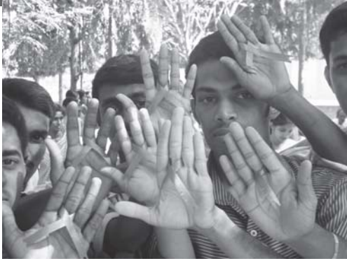
Youth Participating in the campaign in Bangalore