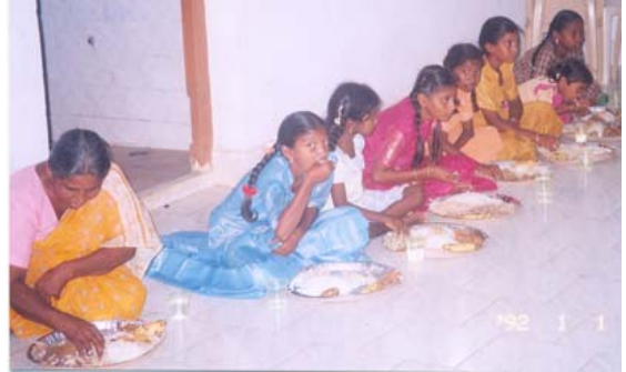
Snehakiran provides them nutritious food to meet their most basic need

Education and nutrition being their prime needs, Snehakiran decided to focus its activity on providing them nutritional and educational support. It helps the poor children for their education by providing them school uniforms, study materials and other expenses. It also provides them nutritious food and mostly required medicines. The members of the Camillian community at Eluru make occasional visits to those families in need of help and assess their situation.