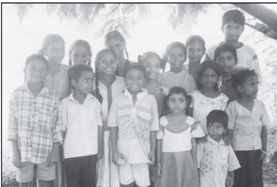
The children under the care of Snehakiran

It tries to take care of many affected and orphaned children. Their parents being succumbed to death due to AIDS-related complexities, most of these children bear the brunt of life at a very young age. When their counterparts elsewhere enjoy the childhood, they face the hard challenges of life as their old grand parents are unable to look after them because of utter poverty.